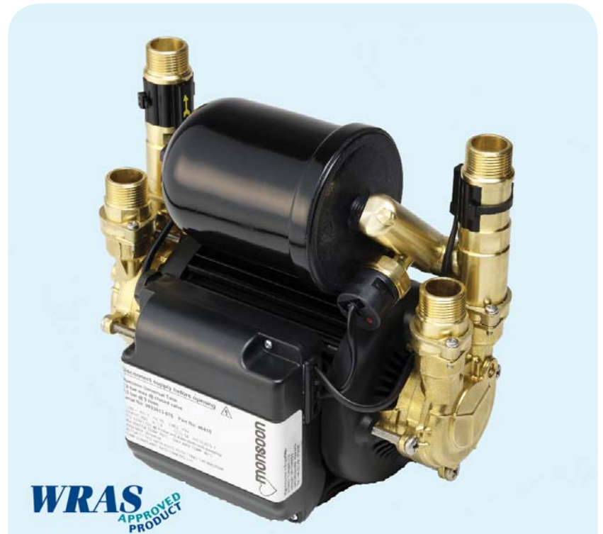
Monsoon Universal Twin Pumps