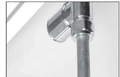
6. Insert pipe .