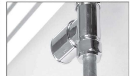
8. Run the central heating to the radiator