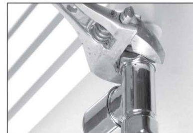
5. Fully tighten the valve using an appropriate tool