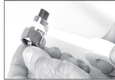
1. Wrap PTFE tape clockwise around the tail thread