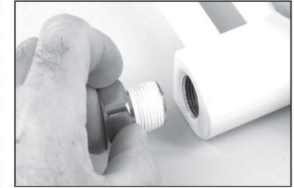
2. Screw the threaded end into the radiator or towel rail