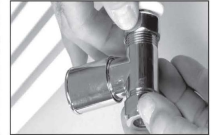
4. Attach valve and turn finger tight in to the correct position