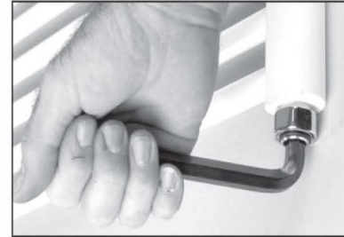
3. Tighten using an appropriate tool