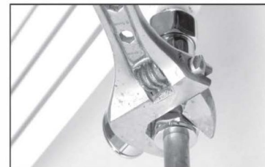
7. Tighten the the nut that holds the pipe in position