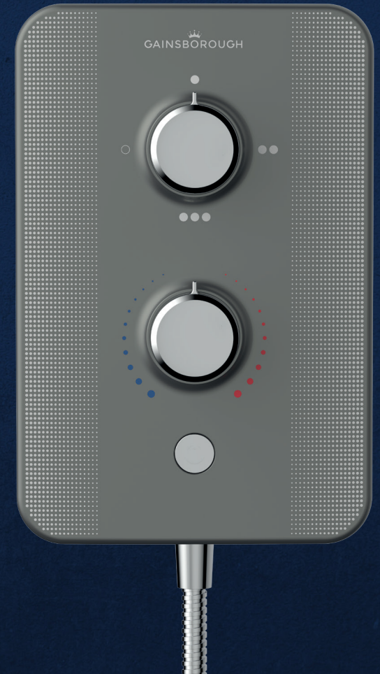
Gainsborough Slim Duo