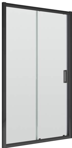
SQ Slider Enclosure

Description: 1200X1850mm Sliding Shower Door