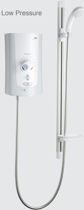
Model shown: Mira Advance Flex Low Pressure