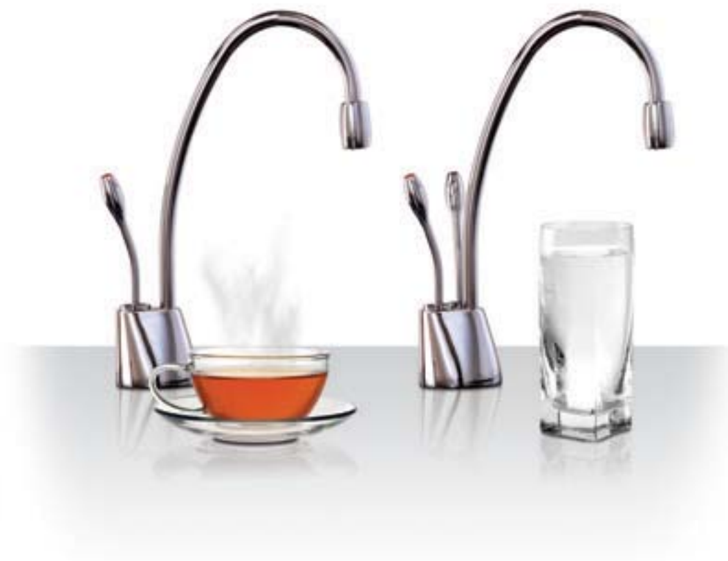
Both models available in brushed steel