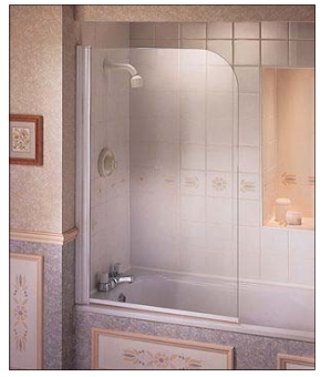
Suitable for all solid bath screens with Maximum length of 1.0m Profile size 15mm high x 3mm wide