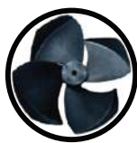
Innovative Fan Blade Design