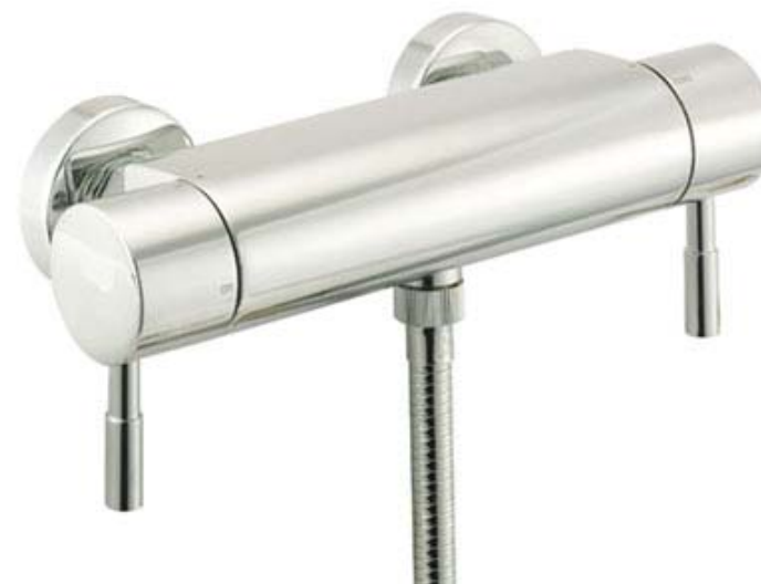
AVUS EXPOSED THERMOSTATIC BAR SHOWER MIXER PWD1181

bathroom brands INTERNATIONAL LTD customerservice@bathroombrands.co.uk