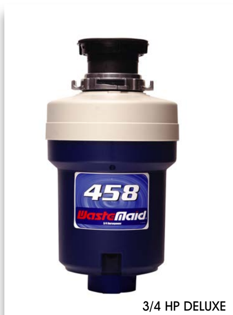
3/4 HP DELUXE