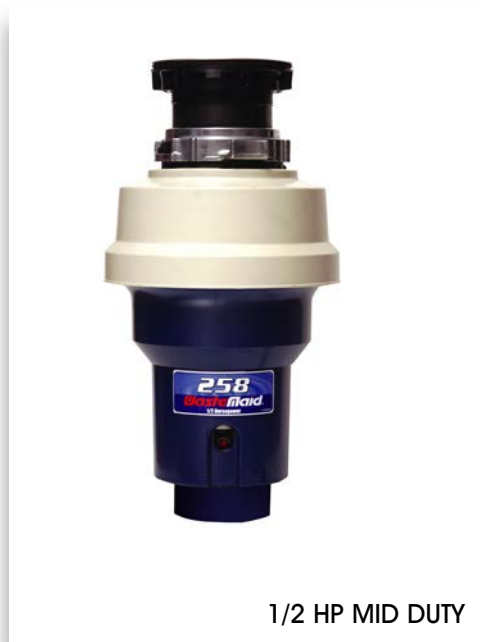
1/2 HP MID DUTY