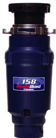
1/2 HP STANDARD