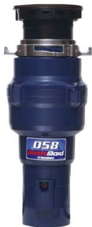
1/2 HP ECONOMY