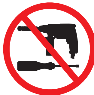
7. Everloc has absolutely no need for drills, screws or glue!

We recommend that you remove and re-apply the product from time to time or if the product is knocked or slippage occurs.