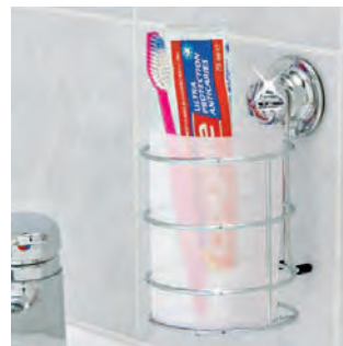
3. Hook on your product and it's ready to use – it's as easy as that!