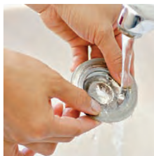
6. Rinse the suction pad in cool water for a few seconds, to re-activate the adhesive and your Everloc product is ready to be re-applied.